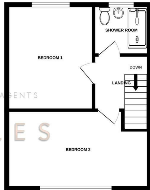
1ST FLOOR 364 sq.ft. (33.9 sq.m.) approx.